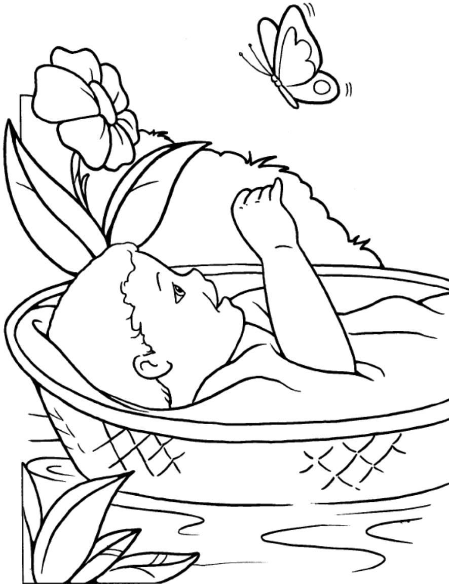
The Baby Moses by the River